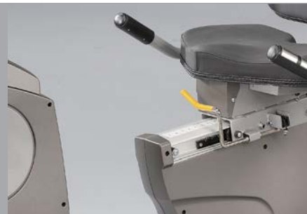
Easy Step-Thru and Seat Adjustment

The CR800 Commercial Semi-Recumbent Bike is the perfect bike for the commercial environment. The step-thru design makes it easy for your clients to get on the bike, and the easy-adjust seat allows them to find the most comfortable position. The console offers multiple programs, most with 40 levels of resistance and enough feedback information to make sure your clients never grow bored of the CR800 . The extra-smooth ride comes from the perfect gearing and the integrated generator/flywheel system. It's all in the details.